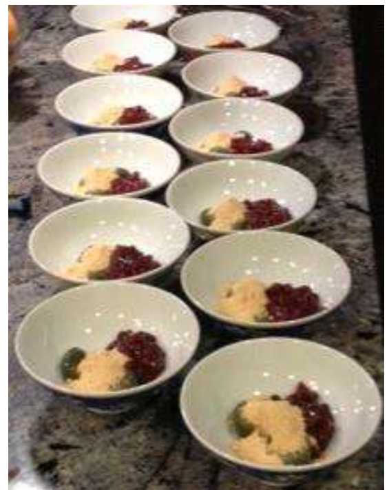
The finished yomogi-shiratamaazuki dessert.